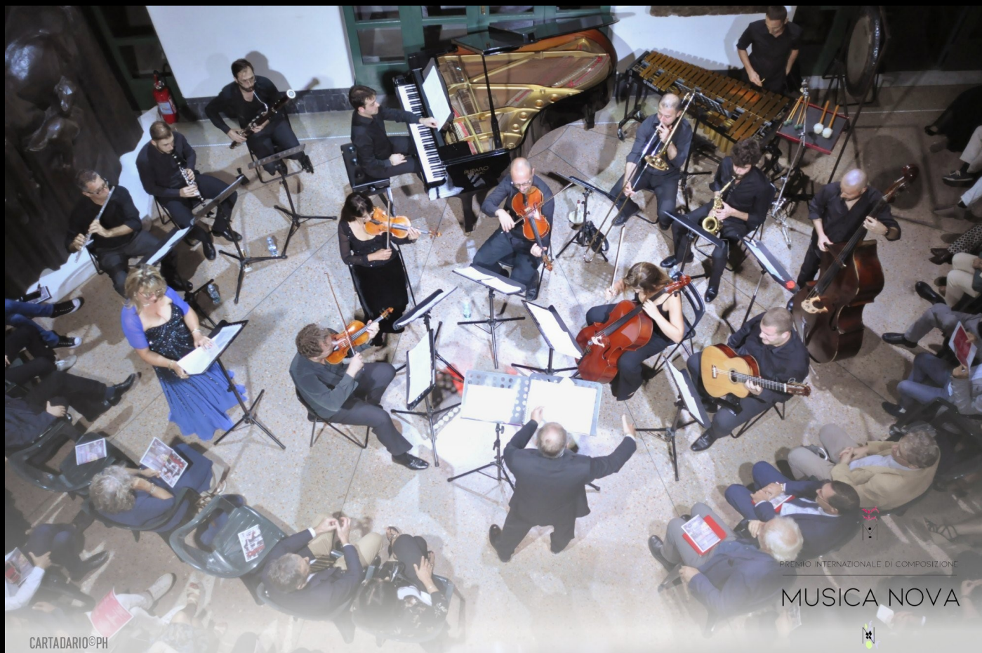
Second Prize performance: Pentarte Ensemble