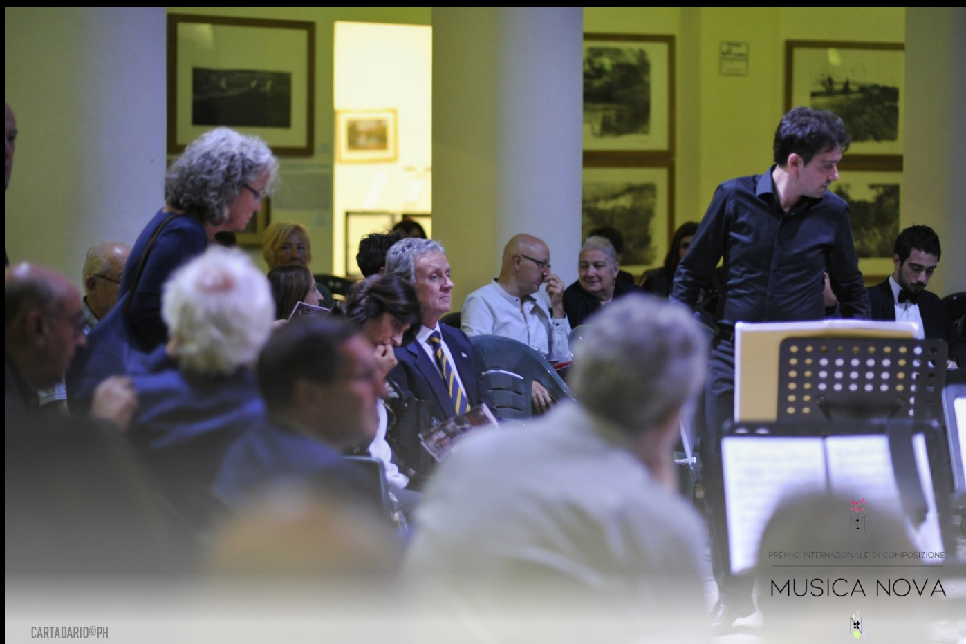
Moments in the audience