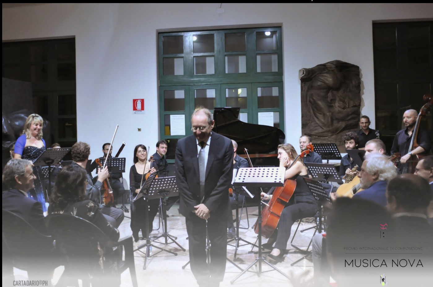
Second Prize performance: Pentarte Ensemble