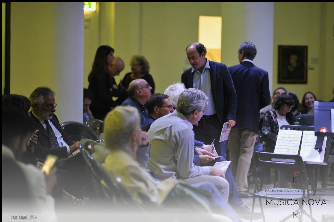
Moments in the audience