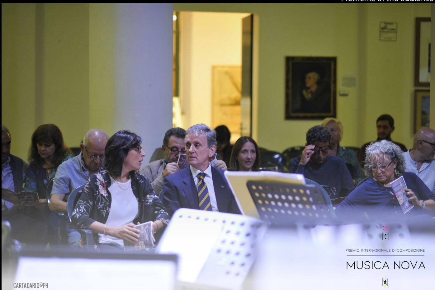
Moments in the audience